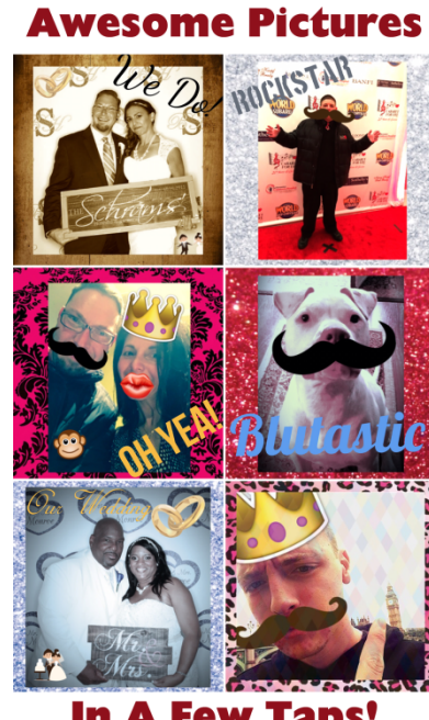
In A Few Taps!

Colonia, NJ – December 15, 2015 - Step It Up Events® is excited to announce the launch of their latest outside the box photo booth experience; THINK Photo Booth Fun , a full-featured, fully customizable, fully free picture sharing app, now available for download in iTunes for the iPhone, iPad and iTouch devices.